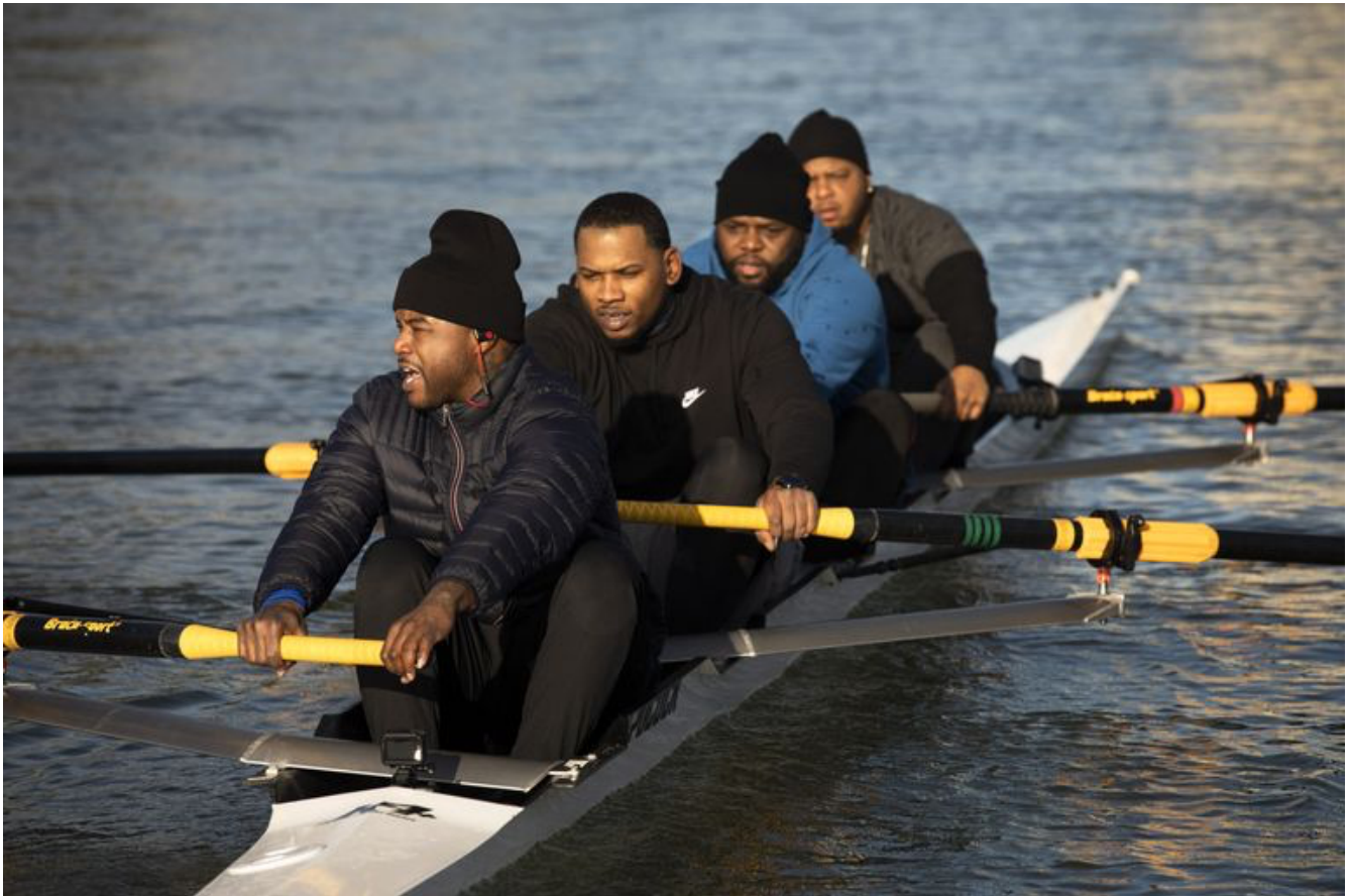
Members of the Manley team on location in Oakland.