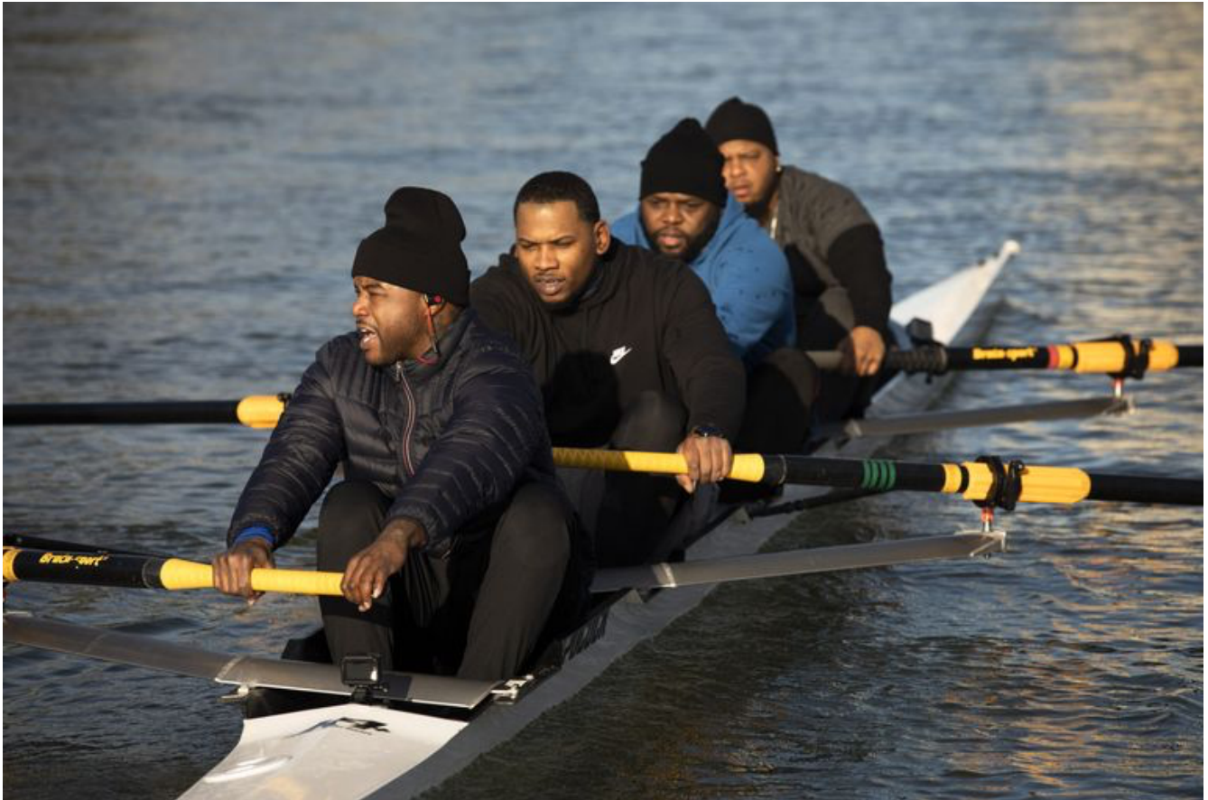
Members of the Manley team on location in Oakland.