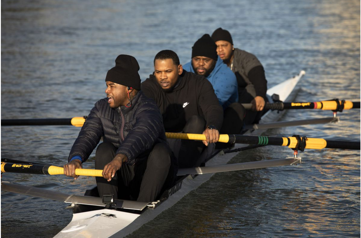
The men of the Manley Career Academy High School rowing team reunite in Oakland, 20 years after their introduction to the sport.